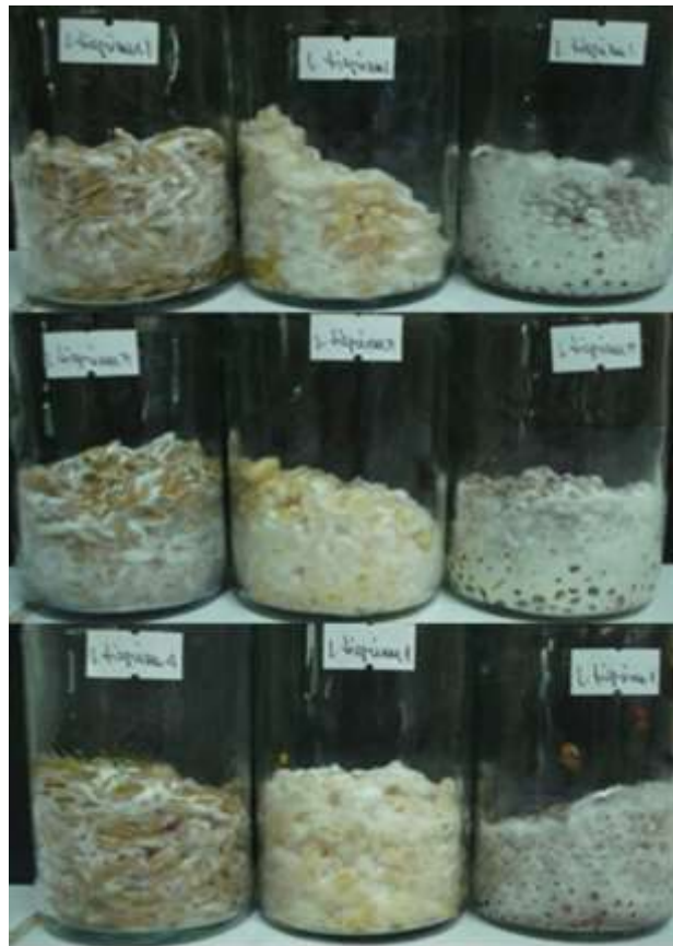
Fig. 2. Mycelial colonization on the different spawning materials: L. tigrinus strain ZB12MF03:(A) unmilled riceseeds, (B) corn grits seeds, (C) sorghum seeds; L. tigrinus strain ZB12MF05 (D) unmilled riceseeds, (E) corn grits seeds, (F) sorghum seeds and L. tigrinus strain

However, the results in this study means that L. tigrinus mycelia efficiently grew in any type of grain spawning materials so it would be easy to propagate the mycelia of this mushroom for mass production. Still these findings contradicts the report of Dulay et al. (2012) where they reported that the incubation period of L. tigrinus was significantly affected by the spawning materials used. Dulayet al. (2012) reported a 5-day incubation period for unmilled rice seeds as compared to our reported 7-day incubation period for all the evaluated grain spawns. Perhaps, different strains of similar species of mushrooms exhibited different mycelial growth on various substrata. Similar observation was reported by Visscher (1989) wherein different strains of king oyster mushroom ( P. eryngii ) responded differently to different substrates, supplements, supplementation amount, and environmental factors in relation to mycelium run, average mushroom yield and quality.